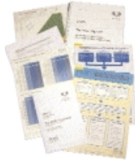
Some of the "MUST" tools and background documents

The 'MUST' and The 'MUST' Explanatory Booklet will be available to download from the BAPEN website ( www.bapen.org.uk ) together with a copy of the Executive Summary of the Report. Copies of the Tool and Booklet are available for purchase from the BAPEN office, together with the Report. Full purchase details are available from the website or from the BAPEN office.